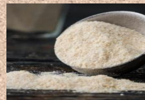
WHITE ONION POWDER