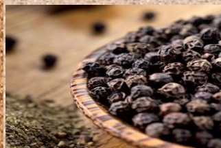
BLACK PEPPER POWDER