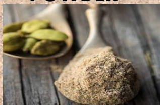
GREEN CARDAMOM POWDER