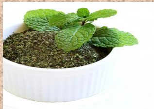
GREEN MINT LEAF POWDER