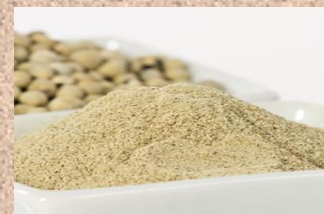
WHITR PEPPER POWDER